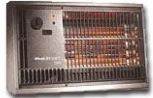
Use Portable Heaters Safely

When you use your fireplace or wood stove to heat your home, keep the door and or fire screen shut to protect your home from sparks. Only burn dry seasoned wood, never rubbish. Garbage and green wood can cause a chimney fire. Remember to have your chimney inspected and serviced before each heating season and change the batteries in your smoke alarms too. A working smoke alarm could save your life.